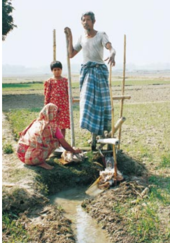
LOW-COST TREADLE PUMPS have helped more than a million Bangladeshi farmers irrigate for the first time.

Costing less than $35, the treadle pump has increased the average net income for these farmers—which is often